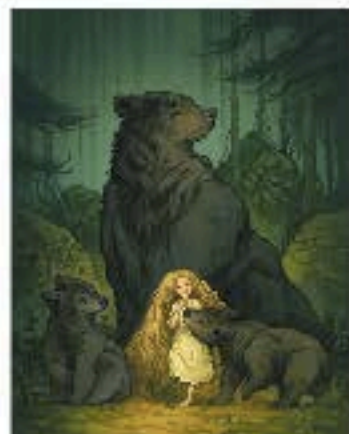
Illustration Print, $10-20